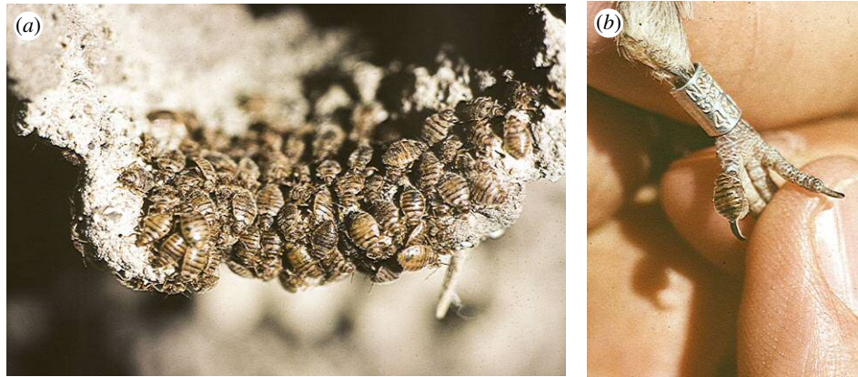
Figure 1. (a) Swallow bugs clustering at the entrance of an unused cliff swallow nest before dispersing by crawling onto the legs or feet of a transient cliff swallow investigating the nest. (b) A swallow bug dispersing by clinging to the foot of a transient cliff swallow captured in a mist net at an established colony site.

and mortality can be high. Thus, if a colony site is unused by birds in a given summer, some of the bugs there will disperse in attempts to find an active colony that can support their reproduction that season. When the wingless bugs disperse from an inactive colony site, they do so by first clustering at nest entrances (figure 1a). They then climb onto the legs and feet of transient cliff swallows (figure 1b) that investigate nests at inactive sites before flying to an active colony, where the bugs crawl off onto nests that the birds visit [17]. Birds are not known to pick bugs off their feet, probably deterred by the noxious scent glands present in cimicids [18].